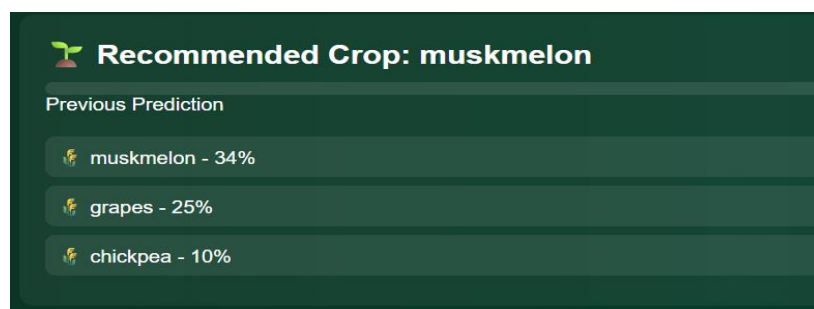
Figure -2: outputs